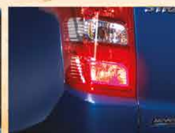
Rear foglamps (GLS)