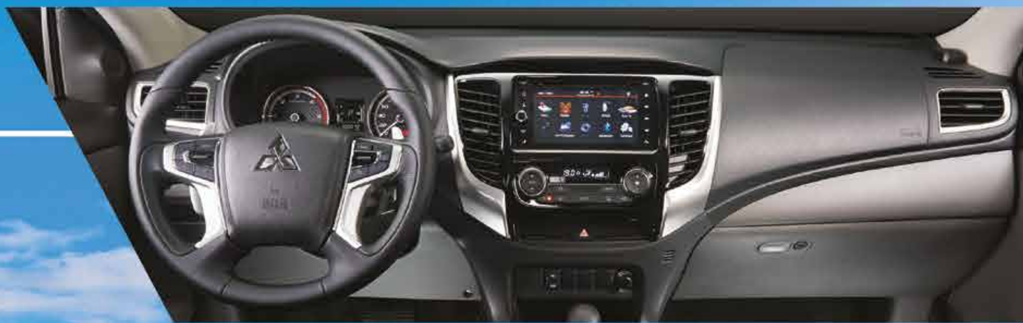
Aesthetically pleasing and ergonomic dashboard • New 4-spoke leather-wrapped steering wheel (GLS)