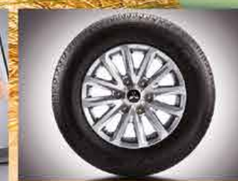
17-inch alloy wheels (GLS)