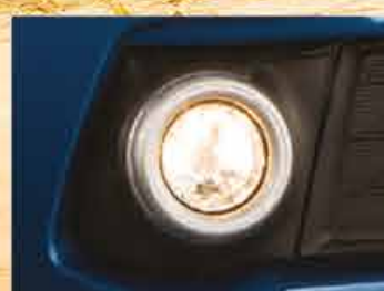
Foglamp integrated Daytime Running Lights (DRL) (GLS)