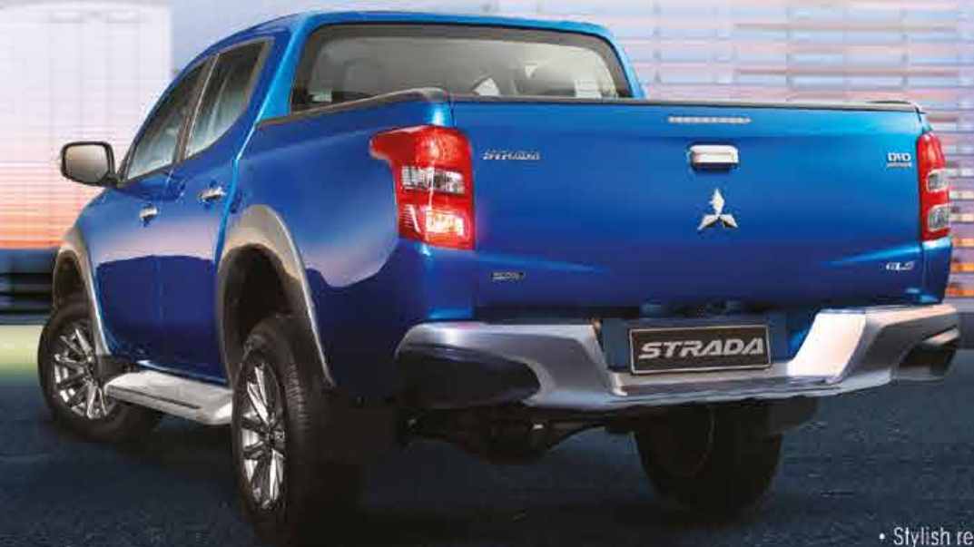
• Stylish rear bumper