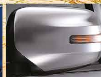
Power side mirrors with integrated LED turn signals and power fold function (GLS)