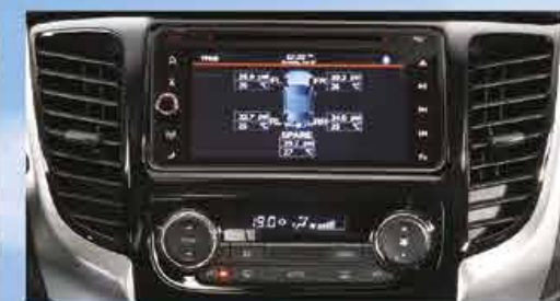
• Multimedia entertainment system with Tire Pressure Monitoring System (TPMS) (GLS Customer Option) • Automatic climate control system (GLS)