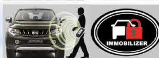
Keyless Operation System with start / stop engine button (GLS)