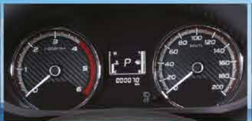
Wheel high-contrast instrument meter cluster (GLS)