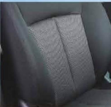
Block high grade fabric seats (GLS)