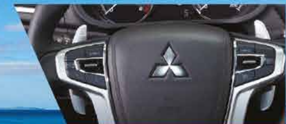
• Steering wheel-mounted audio (GLS) and cruise controls • Magnesium alloy paddle shifters (GLS A/T)